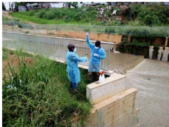
IPCI Sampling in the Discharge Canals