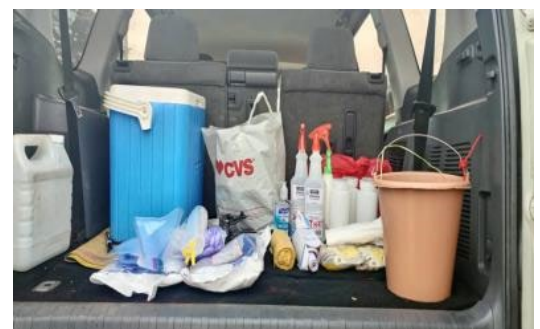
Safe sample collection equipment