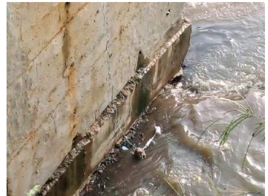
Passive sampling in discharge canals (SARS-CoV-2)