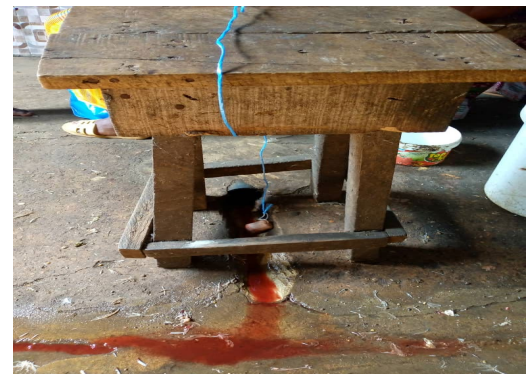
Passive sampling in slaughtering liquid waste effluent (IAV/HPAI)