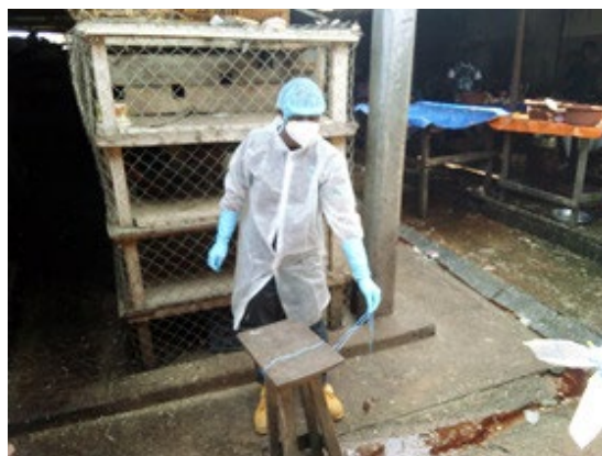
LANADA Sampling in the poultry slaughtering waste